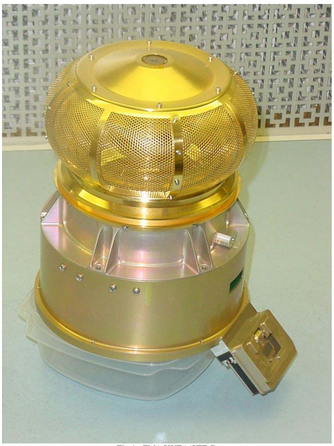
Fig 1. FM1 SWEA/STE-D